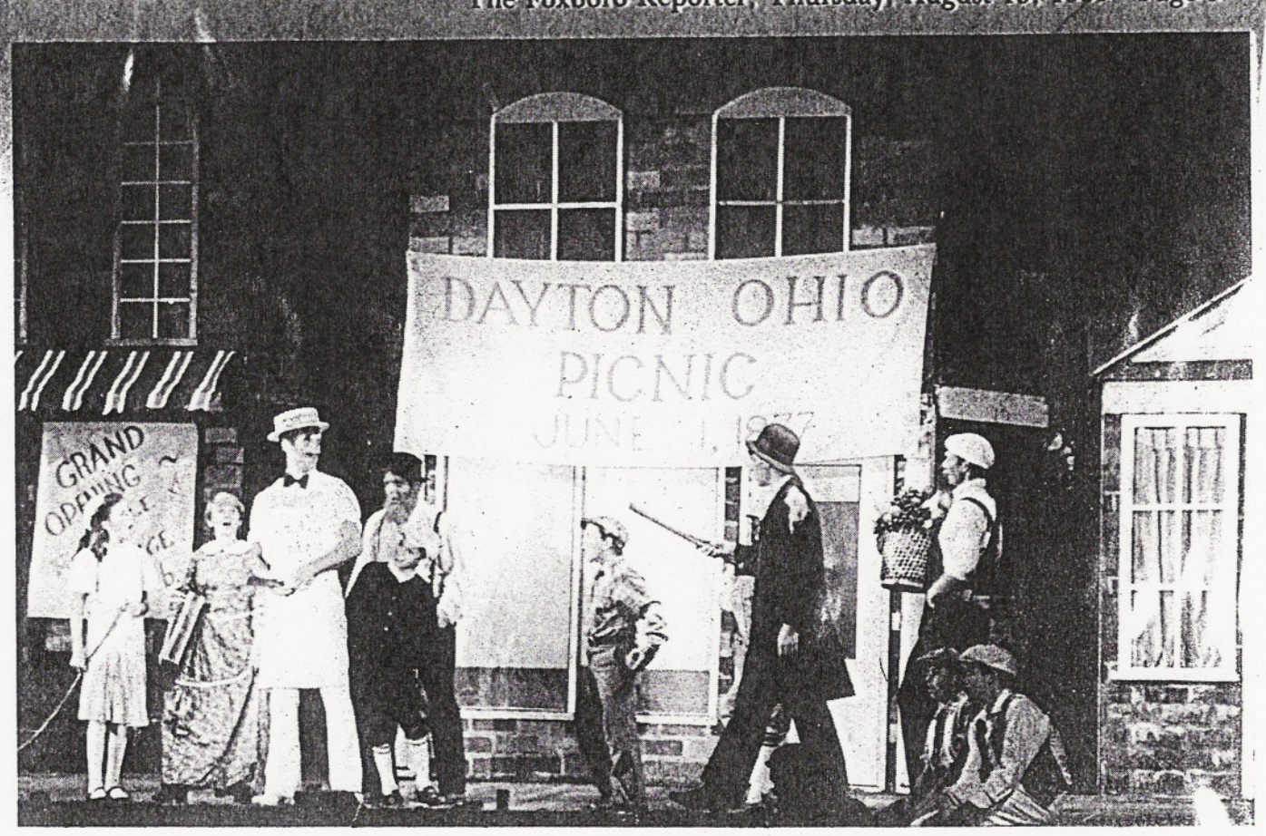
THE RIO HONDO PLAYERS in "Common Stuff," based on the life of the Wright brothers, presented at Normandy Farms Campground last week by the troupe of touring California students, they use the play to pay for their visits to historic sites around the country.