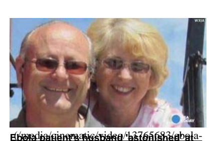
Ethoral parisings vives riske / har 16 firshed bata-U.S. Racklashus U.S. All NOWhished-at-us-Aug 08, 2014 backlash-usa-now/)